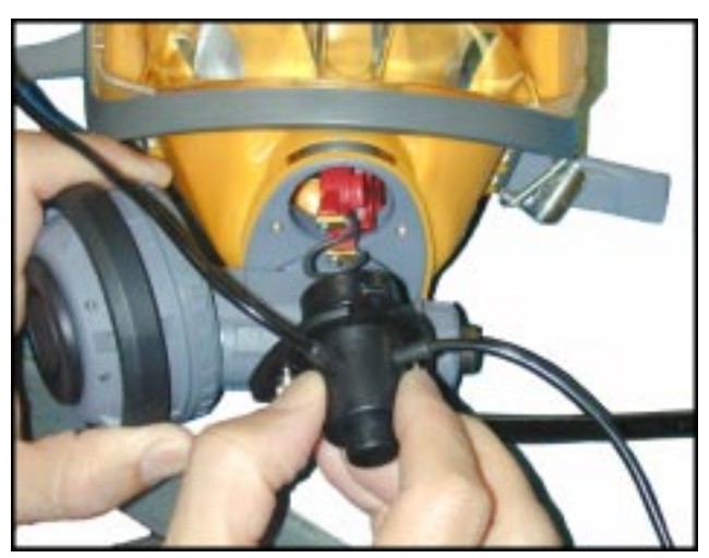
2. Insert the microphone portion into the port. The nickel microphone wires may need to be bent slightly to install. Tighten thumb screws (hand tight only).

1. Remove the existing AGA cover plate by loosening the two thumb screws.