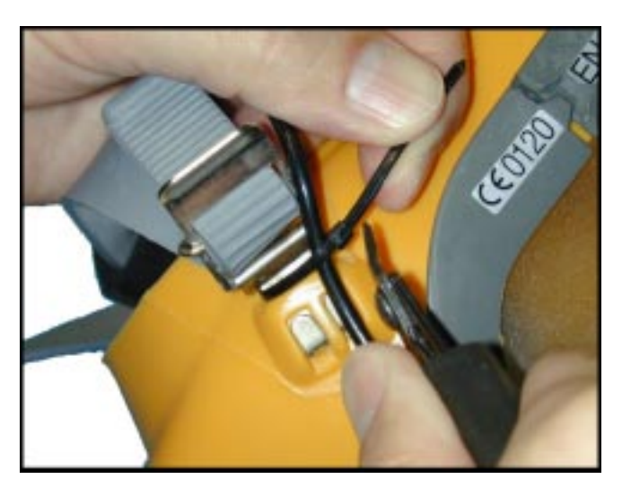
9. Loosely secure the cable to the buckle of the full face mask with the supplied tie wrap as shown. CAUTION: Be sure the tie wrap does not bind the cable so it can slide freely. Improper installation may cause the mask to leak.