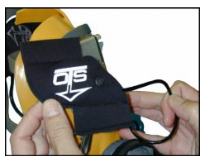
5. Ensure the snap of the EHA-1 earphone holder is facing towards the front of the mask and the logo is upright.