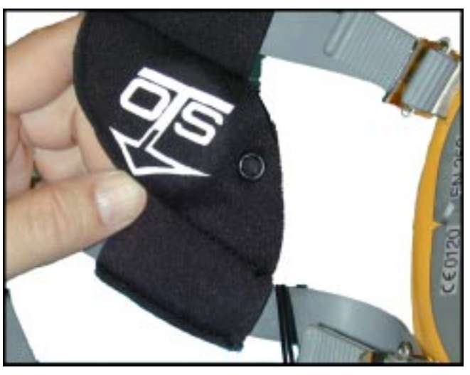
8. Insert the earphones with the cable coming out below the snap. Secure the snap.