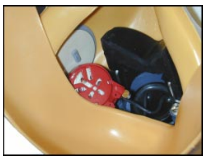
3. Once the microphone is inside the port, carefully position the microphone within <sup>1</sup>/<sub>4</sub>" from the diver's lips. This will place the microphone at the left corner of the diver's lips. The Hot Mic is shown above, other microphones are available.