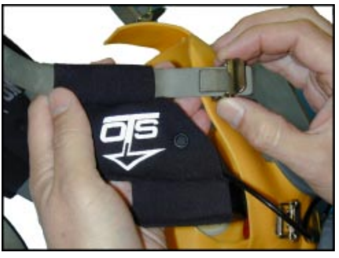
6. Insert the AGA straps through the top and bottom slots of the EHA-1. Re-assemble the AGA straps into the mask.