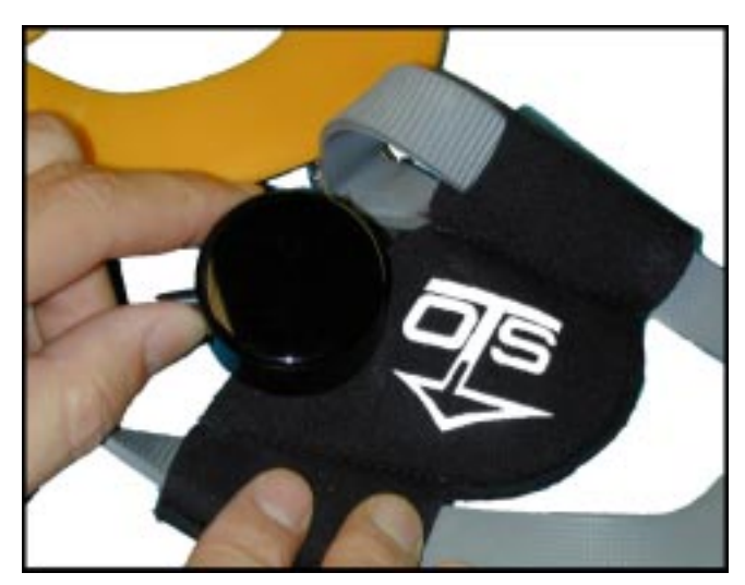
7. The EP-2 earphones are directional. Ensure the soft side is facing toward the diver's ear.